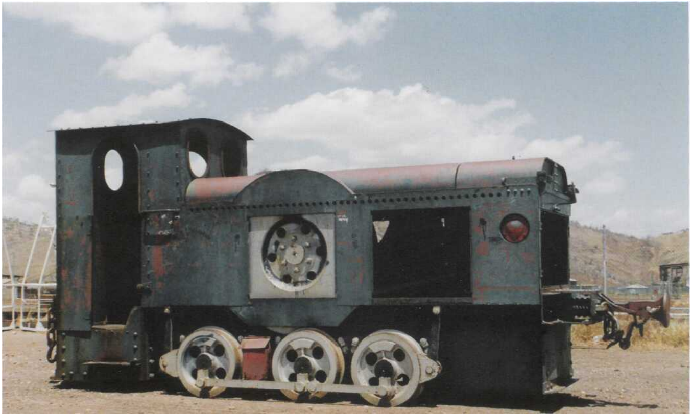
West Australian Public Works Department 0-6-0PM NW 3 "Kaiser" (Rhnrthaler 161 of 1912) at the Department of Transport workshop, Wyndham port on 27 September 1992.