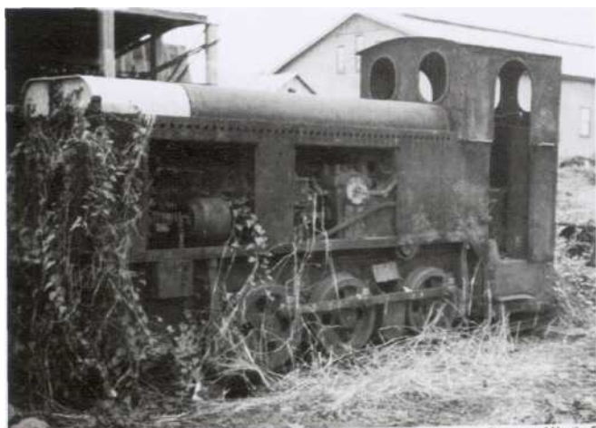
161, 'Kaiser', at Wyndham in October 1944.

The first four miles out of Port Lincoln, which is mostly uphill, was carved out in the even time of one hour, but the next mile, which was all downhill, took only four minutes. This was the fastest the engine ever travelled under its own power. Coomunga, 14 miles from Port Lincoln, was reached in just under four hours. After a short spell to report progress to Port Lincoln, where everyone was getting anxious, a start was made for the next siding, Pearlah. As the train was started