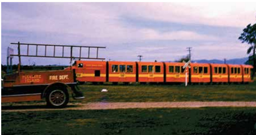
The Pleasure Island tram, seen here partially hidden behind the firetruck, was a very smartly presented unit. Peter would like to hear from anyone with more of the history or subsequent disposal of the locomotive and carriages.