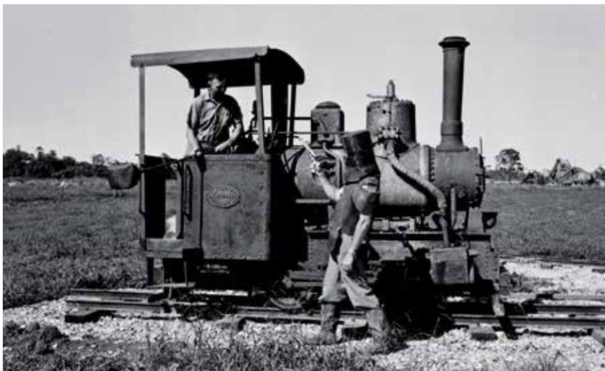
Ned Kelly bushranger style re-enactment with Fowler 0-4-0WT (16249 of 1925) at Pleasure Island amusement park, Carrara, Queensland, circa 1960.